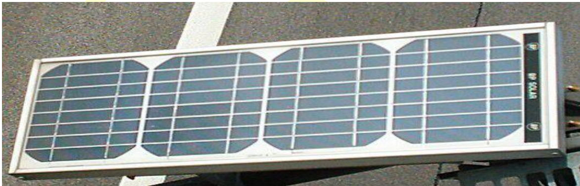
Figure 1. Design of Solar panels produced by the company