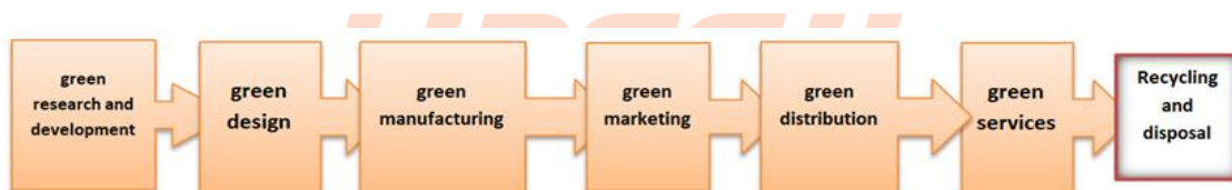
Figure No. (1) Green value chain activities

The green value chain consists of a set of activities starting with green research and development and ending with green recycling. These activities will be explained as follows: