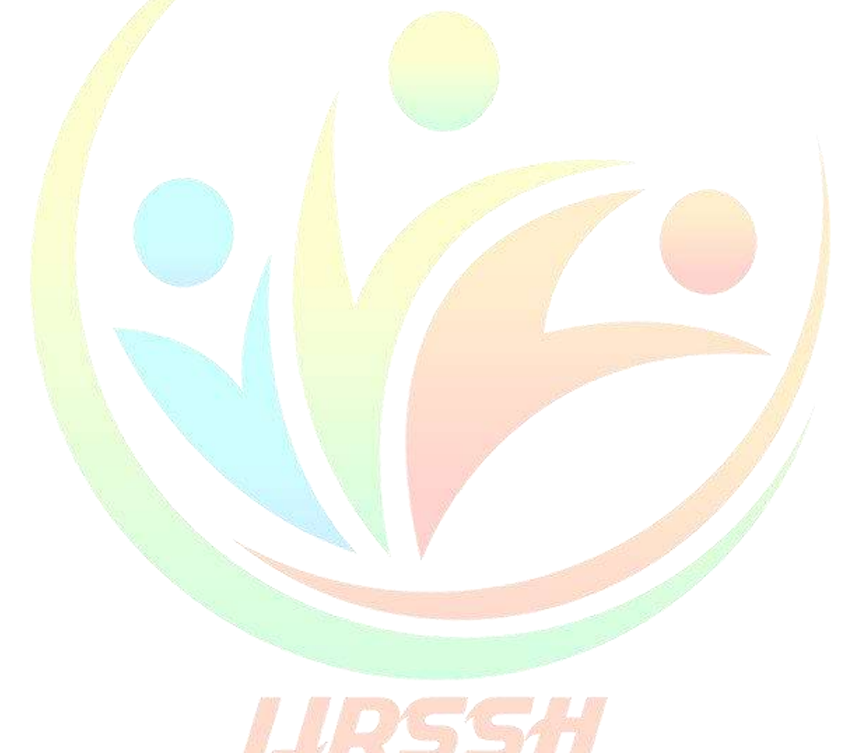
INTERNATIONAL JOURNAL OF RESEARCH IN SOCIAL SCIENCES AND HUMANITIES