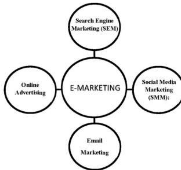
Figure No. 2: E-Marketing dimensions

E-Marketing classified for (4) dimensions as below figure: